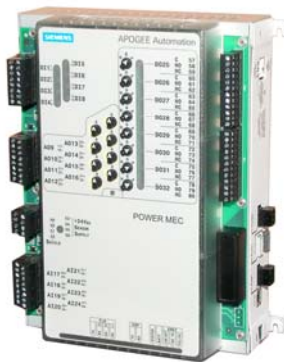
Figure 1. Power Modular Equipment Controller.