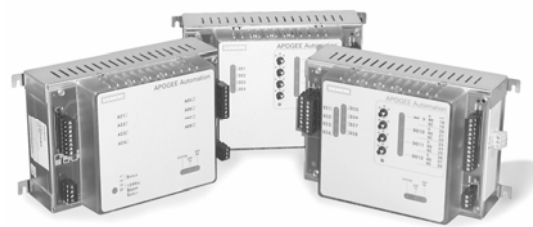
Figure 5. Analog and Digital Point Expansion Modules.

The digital inputs are dry contact with four of the inputs being pulse accumulator points. The relayed digital output points support 110/220V Form C relays.