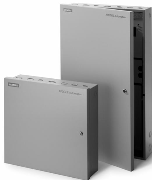
Figure 3. Two sizes of Power Modular Equipment Controller enclosures.

The enclosures are constructed of metal to accommodate secure conduit fittings and protect components against electrical transients. The enclosure allows space for easy wire routing and terminations.