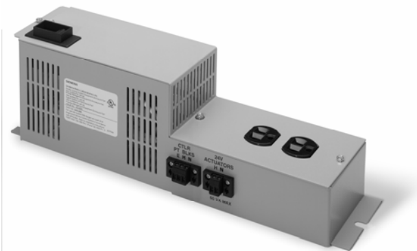
Figure 4. Power Modular Equipment Controller service box.